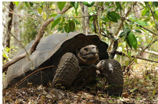
Figure 1. Galápagos giant tortoise ( Chelonoidis becki ) from Volcano Wolf, Isabela Island. This group represents in icon for the plight of threatened and endangered species. Genetic approaches have been extensively used to guide conservation decisions and assess management outcomes.

Giant tortoises ( Chelonoidis sp.; Fig. 1) are flagships for endangered species conservation in the Galápagos Islands, particularly in the context of recent and severe population declines. When humans first arrived in the archipelago, tortoises were broadly distributed and extremely abundant (Porter 1815; Van Denburgh 1914). However, populations were decimated by buccaneers in the late 1600s and 1700s, and then by whalers and the crews of naval vessels from the late 1700s to the early 1900s (Townsend 1925; Slevin 1959). Up to 200,000 tortoises were killed within only two centuries of harvesting (MacFarland et al. 1974). Most recently, introduced mammals have become the main threats to tortoise populations, compounding the